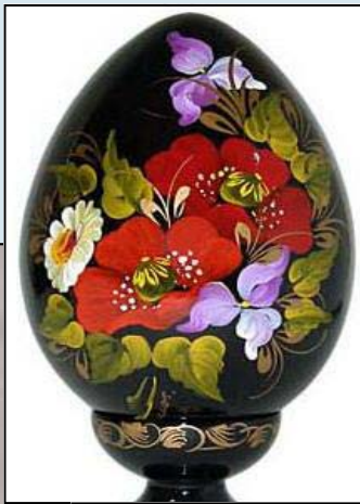
Ukrainian Easter Eggs

Some "crafty" samples to pique your interest