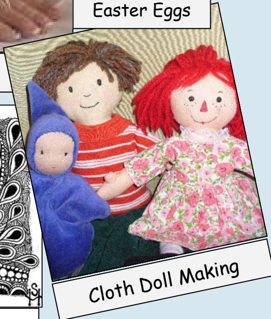
Cloth Doll Making